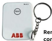
Remote test control